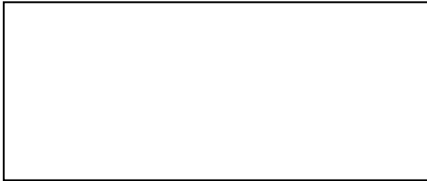
Figure 3: Ecological Marginalization